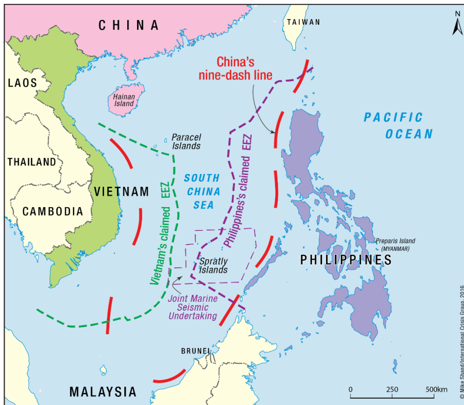
Map 4: Joint Marine Seismic Undertaking

Around the same time, sentiment was turning against Arroyo and Chinese investments. The president and her husband were accused of corruption in a $329 million telecommunications deal with a Chinese company, and JMSU revelations further energised her critics. 103 Opposition lawmakers filed resolutions seeking probes into whether the administration had compromised sovereignty and sold out national territory for an $8 billion loan package. Some urged impeachment. 104