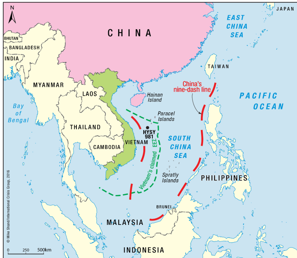
Map 2: Deployment of HYSY 981

Said to be “born for the South China Sea”, HYSY 981’s mission has always been more than commercial. Then CNOOC Chairman Wang Yilin called it on commissioning “mobile national territory” that would help “ensure our country’s energy security, advance maritime-power strategy and safeguard our nation’s maritime sovereignty”. 37 In May 2014, China deployed it seventeen nautical miles from the south-western-most island in the Paracels, whose sovereignty Vietnam also claims. The ferocity of Hanoi’s pushback and a chorus of regional criticism prompted Beijing to quietly adjust tactics. HYSY 981 was sent to the Bay of Bengal from February to April 2015. 38 In June, it was again deployed to an area where Chinese and Vietnamese claims overlap, but on the Chinese side of the median line between the two coasts. Hanoi largely remained mute. 39