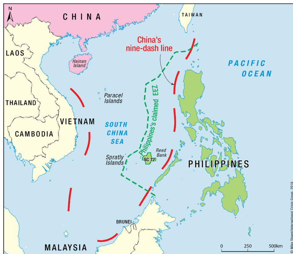
Map 3: SC-72

Parallel to friction and confrontation, however, hydrocarbon exploration in the South China Sea is also a tale of repeated attempts at cooperation.